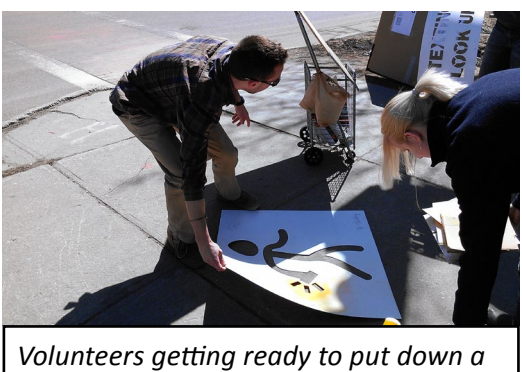
stencil on the sidewalk

You will most likely need to get permission from your area's public works department (or its equivalent), before starting the project. You will also need to purchase supplies and identify a group of volunteers to deploy the stencils.