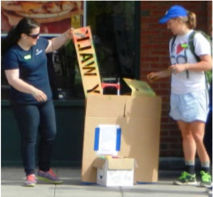
You can see the sheet protector with the stencil's Visual Guide page taped to the portfolio with blue tape